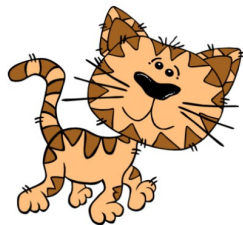
Charlie the Cheetah