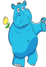
Holly the Hippo