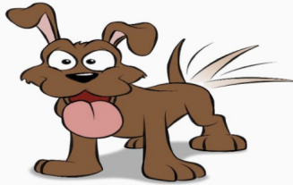
Danny the Dog